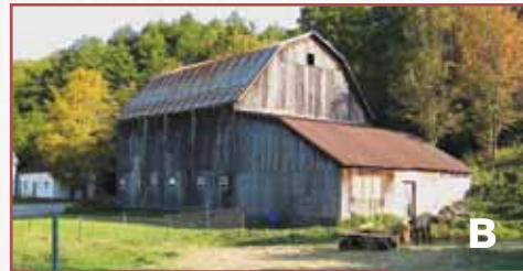
Salt Springs State Park near Montrose, PA

One area in agriculture that has seen an increase in recent years is small scale diversified farms. Often "alternative" or organic, these farms are more likely to be direct marketers. Often new farmers, they may have another job and may not have been raised on farms. They may be bringing outside capital into agriculture to get started. These operations have the potential to use old barns in new ways.