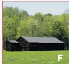
Rt. 220 South of New Albany, PA

Tobacco production occurred from the early 1800's up until the mid-1960's along the Susquehanna, Chemung, Tioga and Cowanesque Rivers and tributaries.