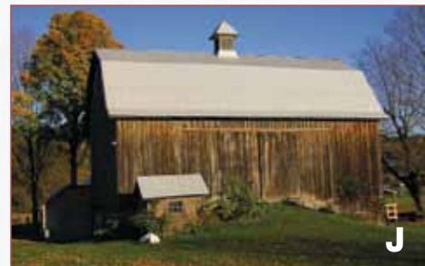
King Barn, Sheshequin, PA