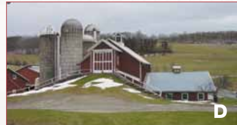
Davis-Young Farm, LeRaysville, PA

In the LeRaysville area of Bradford County, there are a number of barns built by a Welsh man named Morgan Thomas from 1889 to 1905. Sometimes called "High Entry barns," they all have a trademark ramp and bridge entrance to the third floor in order to make use of gravity when unloading hay. These three-story barns may have been modeled after the coal breakers that lifted coal up several stories to be sorted on the way back down.