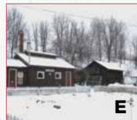
Back Achers Farm, North Rome, PA

Built for boiling maple sap in the spring, these buildings are readily identifiable when in operation due to a billow of steam emanating from them. Small in size, they will have a chimney and may have a large wood pile adjacent to them.