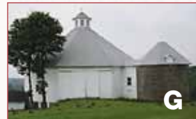
Near Montrose, PA

Rare. Sometimes barns were built in unusual shapes. This was particularly true when farmers and builders were experimenting to find the best ways to house increasing numbers of animals in the most efficient ways.