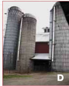
Davis-Young Farm LeRaysville, PA

Silage - a process of fermenting cut grass before it dries in order to increase nutrient retention - has been in use since the early 1900's but wasn't wide-spread until the last 30 years. Early silos were made of wood and ceramic tile, later of concrete and metal. On confinement farms where animals are kept inside year round, farms may have many large silos.